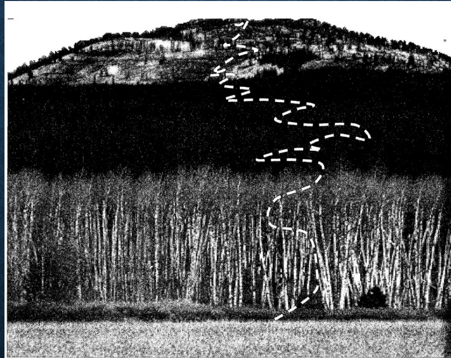
Exhibit 6. A path through the woods.